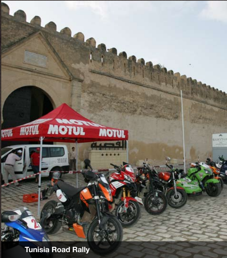
Tunisia Road Rally