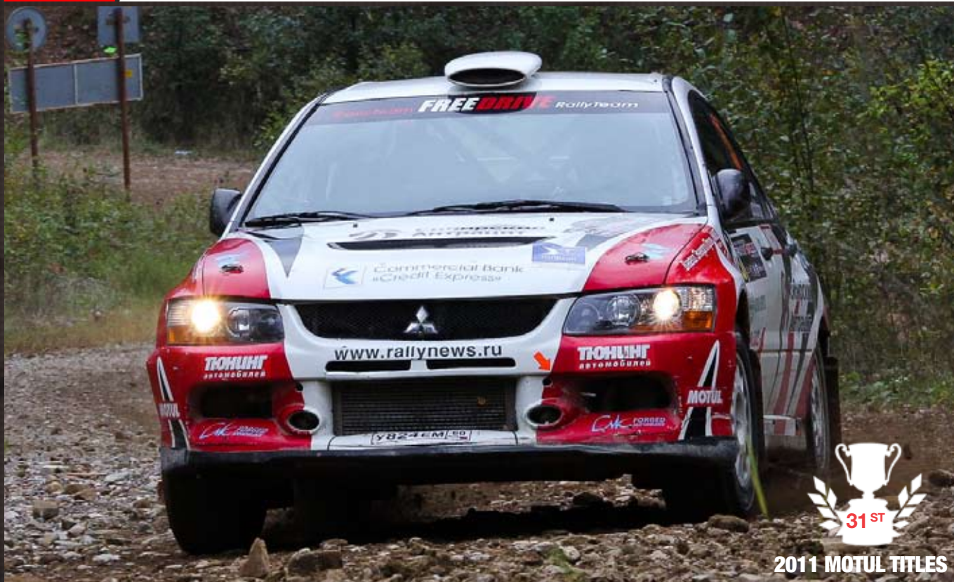
Broslavskiy - Mukhina / FreeDrive Team / Mitsubishi Evo